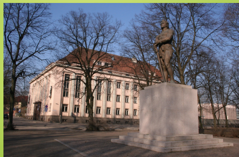
Ministry of Education and Research in Tartu