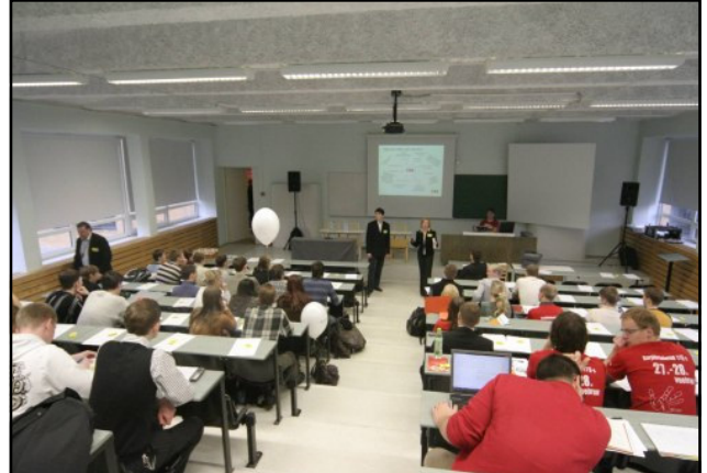
Board of European Students of Technology