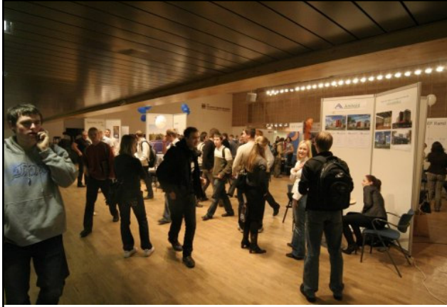
Board of European Students of Technology